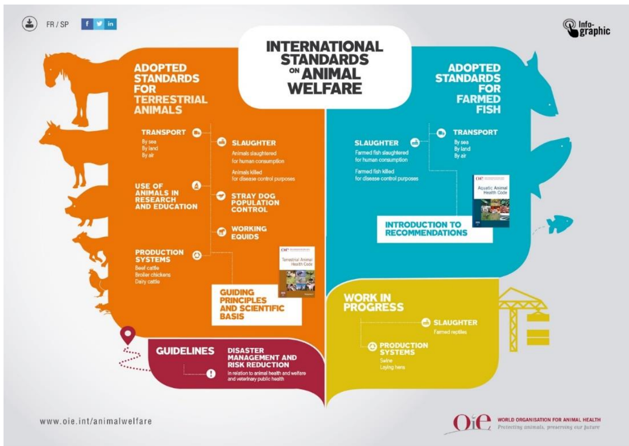
Figure: Overview of the OIE international standards on animal welfare ( www.oie.int )

In March 2017, the ISAE established a collaboration with the World Animal Health Organisation (OIE). The OIE is a corporate member of the ISAE, and the ISAE is represented at the OIE Global Animal Welfare Forum, which meets annually to discuss current animal welfare issues of global importance and to develop initiatives to move forward. The latest meeting of the Forum was 11-12 April 2019, where transport of animals was the topic, with focus on identifying challenges and exploring solutions in animal transport (land, sea and air).