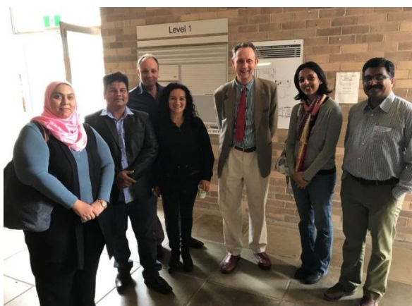
Australasia-Africa regional meeting attendees enjoying the social aspects of the meeting