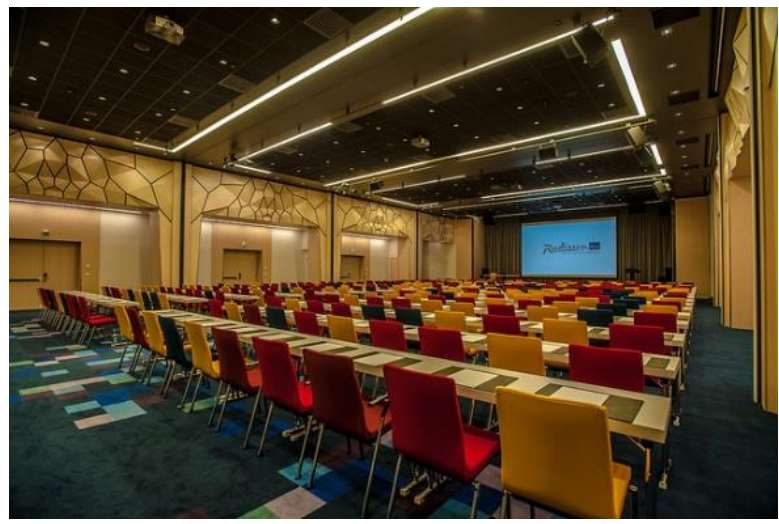
Kongesalen, The King's Hall, part of the scientific session area.