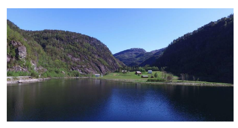
Mostraumen, part of one of the excursions into narrow fjords.