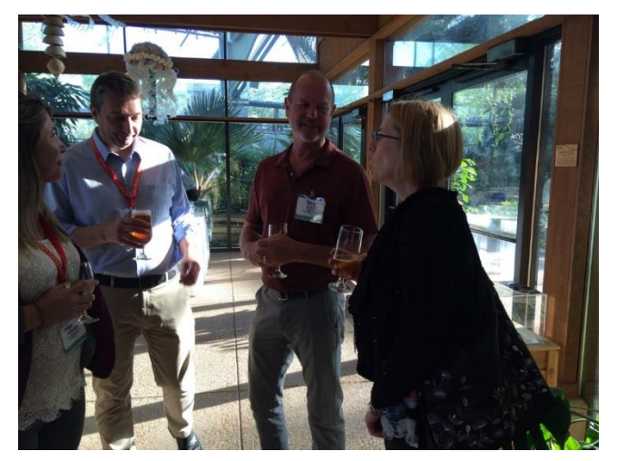
Deep conversation among attendees at the conference banquet