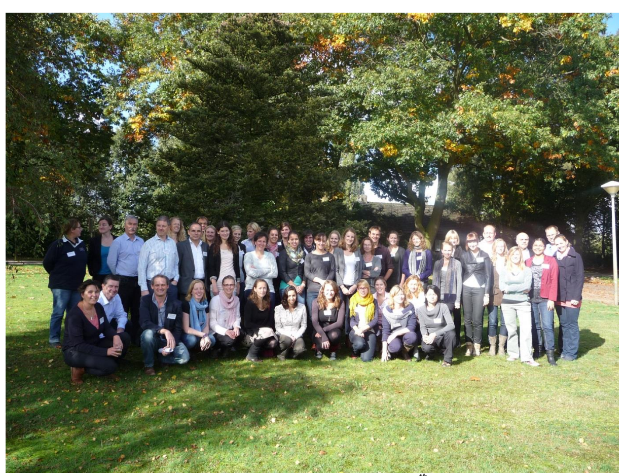
Participants at the ISAE Benelux conference held on October 10<sup>th</sup> 2013 in Sterksel, The Netherlands