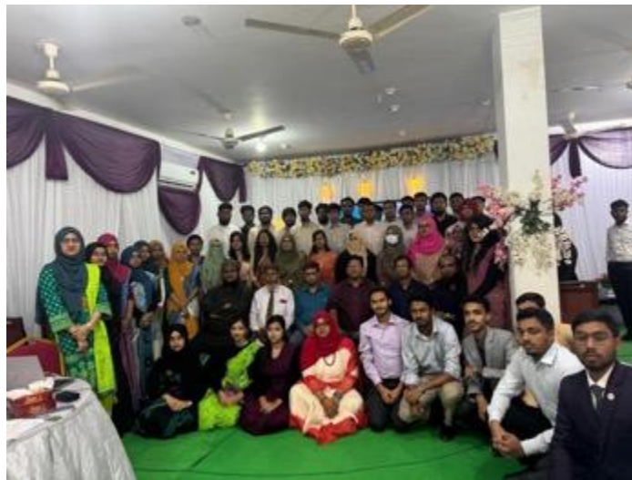
Photos of some participants at the 8th ISAE Animal Welfare Workshop in Bangladesh