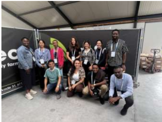
DCCAF 2025 Awardees and the ISAE Development and Assistant Development Officers at Excursion to the Insect Farm