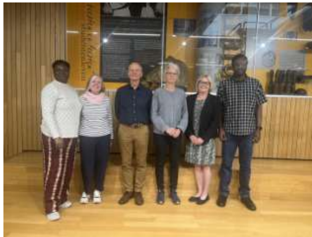
DCCAF Pre-Congress Workshop Speakers, together with the ISAE Development and Assistant Development Officers

The pre-congress workshop took place on 4th August 2025, followed by an excursion on Wednesday, 6th August, where the DCCAF awardees, Development Officers, and other conference delegates visited a fish research station and an insect breeding farm — an enriching experience that combined learning with practical exposure.