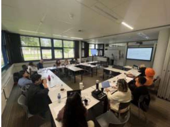
Pre-Congress Workshop on the 4 th of August, 2025