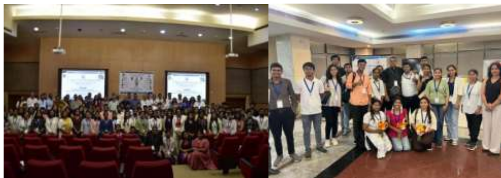
Pictures from ISAE workshop in India

This engaging forum emphasized modern, evidence-based approaches to sustainable and ethical animal management, inspiring participants to integrate scientific insights into animal welfare practices across diverse contexts.