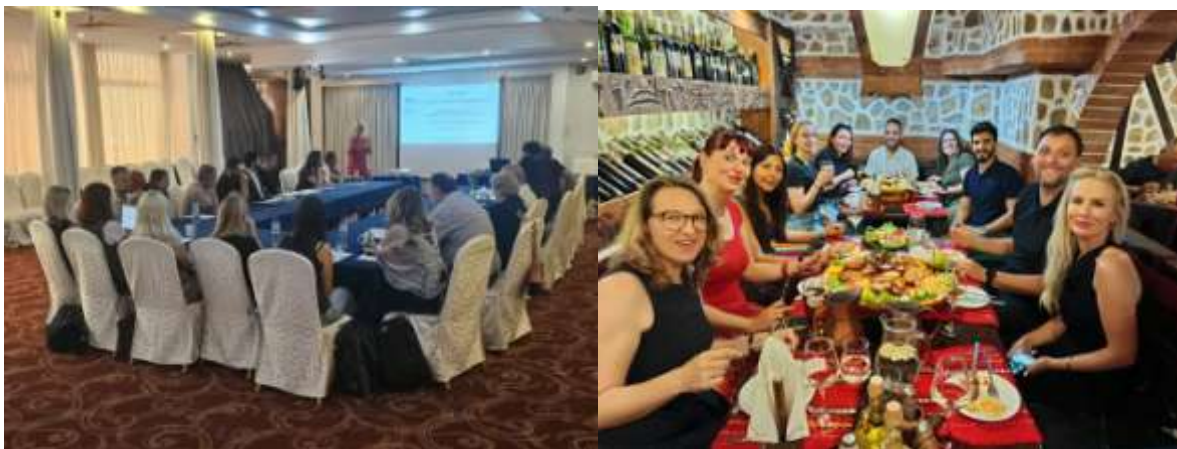
Pictures from ISAE East Central/East and South Europe Regional Meeting 2025

The ISAE East Central/East and South Europe Regional Meeting 2025, titled "Bridging Science and Practice: A Workshop on Farm Animal Welfare Assessment", was held from 24 to 26 June 2025 in Sofia and Kostinbrod, Bulgaria. Hosted by the Institute of Animal Science, the workshop aimed to address the realities of farm animal welfare in lower-budget agricultural systems, typical of many Eastern European countries. The event gathered 25 participants from 9 countries, creating a truly diverse mix of early-career researchers, experienced academics, and practitioners working across different animal welfare contexts. Over the course of 13 presentations, including 5 plenary talks, the programme explored species-specific welfare assessments, legal frameworks, digital tools, and on-farm applications—always with a focus on combining theory and practical relevance.