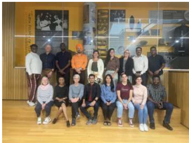
DCCAF Pre-Congress Workshop Speakers, along with the DCCAF 2025 Awardees and the ISAE Development and Assistant Development Officers