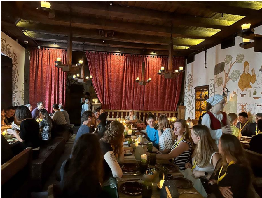
Dinner on the Tuesday night in the Olde Hansa restaurant.