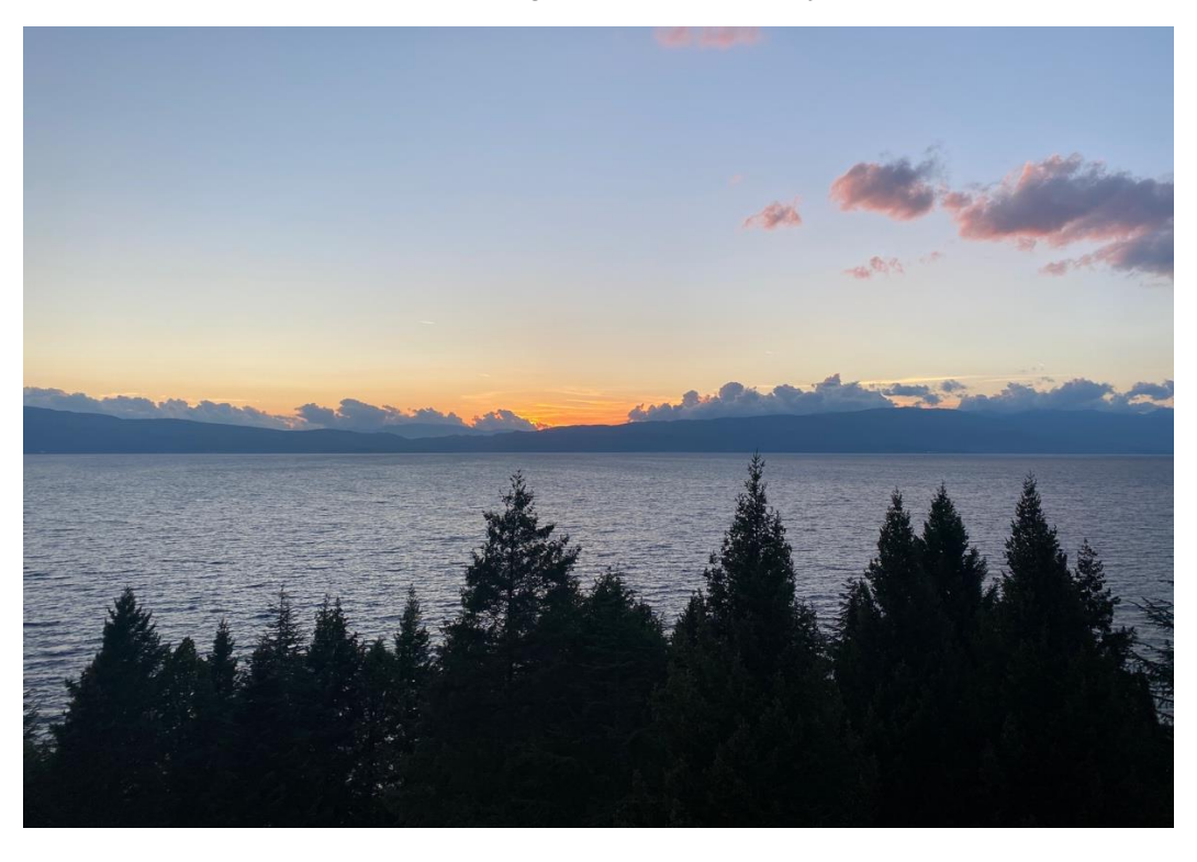
View of Lake Ohrid from the congress venue