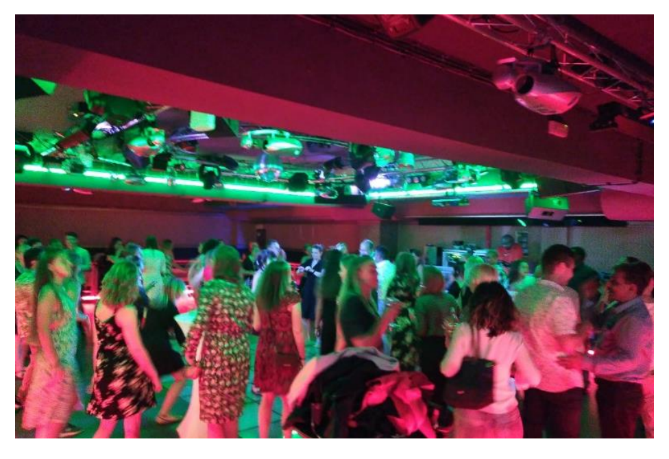
... for some more dancing.