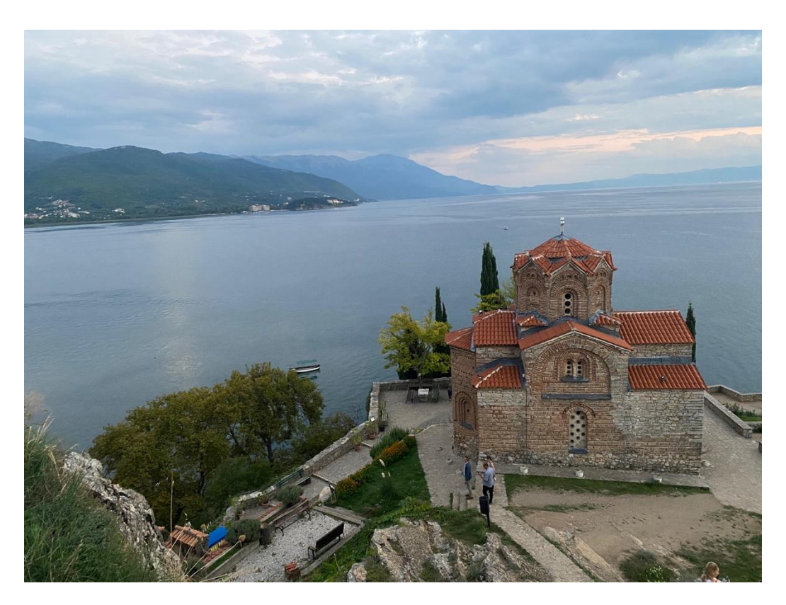
The beautiful sights of the Ohrid city tour